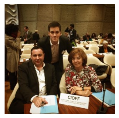
Meeting of UNESCO – NGO Liaison Committee—November 2014