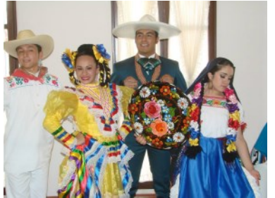
CIOFF® Cultural Conference in Zacatecas under the High Patronage of UNESCO