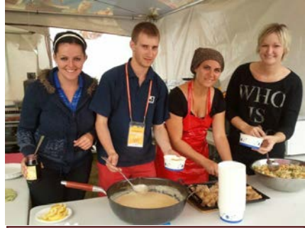
CIOFF® Sectors Days, Introduction of international culture / sharing experience of traditional foods