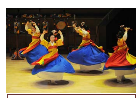
Korean Folk Dance Concert