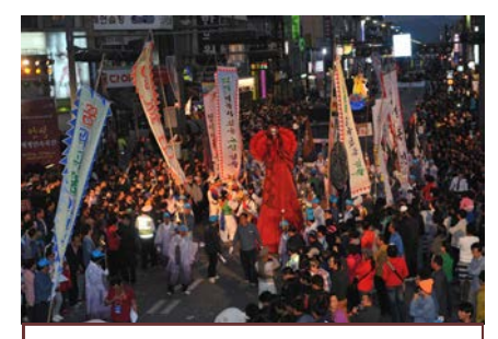
The Memorial Service for Baudeogi, Parade of Nations with 53 groups. 2,178 participants

The event received great TV & radio coverage, it was featured 12 times on SBS, KBS, EBS channels, broadcasted on the Radio 180 times and covered in Newspapers 247 times. The Official Folkloriada Programme included the following events: