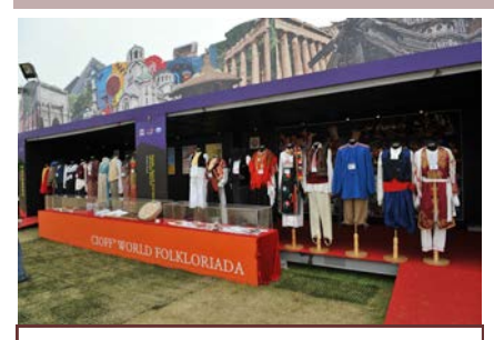
Costumes Exhibitions at World Zone