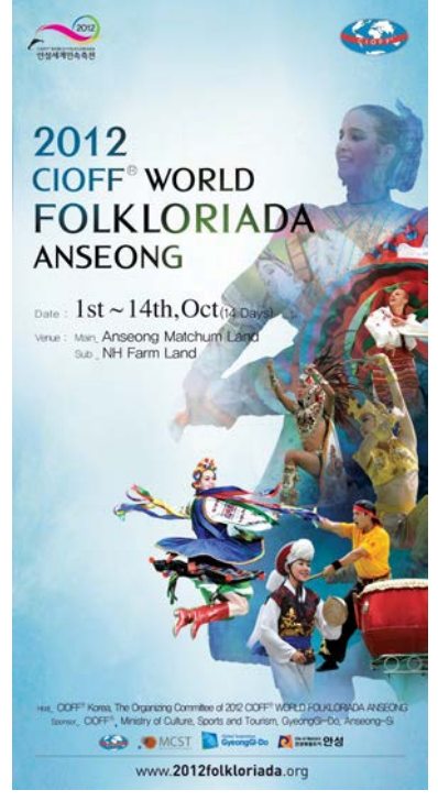
"Communication of human kind through the world of folklore" with a slogan "Anseong, Be Moved!"