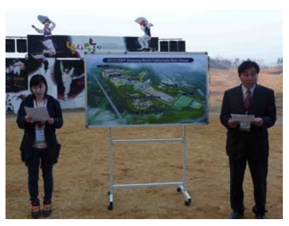
CIOFF® KOREA 2010 LEGAL COMMISSION