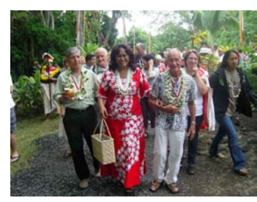
ADMINISTRATION / ACTIVITIES

CIOFF<sup>®</sup> Tahiti, with the support of the High Commissioner of the Republic in French Polynesia, of the Government of French Polynesia, of the Ministry of Culture and Arts, the Ministry of Tourism, the Ministry of Youth and Sports, and with the support of the municipalities (Communes) surrounding the town of Papeete created a fantastic memorable experience for all the guests, which will stay with us forever.