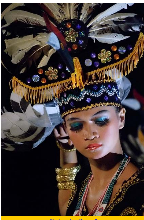
"Indonesian Beauty", Photo by Tamas OLLERINYI, Hungary Winner "Portrait" Category -

Due to the huge success of the 1st CIOFF International Photo Competition in 2006, the Council has decided to hold another Photo Competition, which was launched at the CIOFF World Congress in Istanbul.