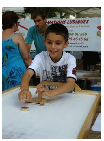
Young boy playing Hockey on table in Romans France

next Folkloriada in Seoul the best of the French expression of regional traditions, thanks to the involvement of several different folk groups' young choreographers. This operation is a big challenge for all of us because Folklore does not get much support from the French government.