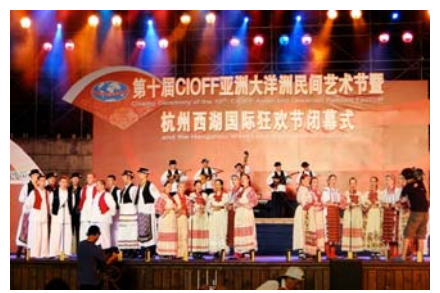
Performance at the Closing Ceremony

Through the display of the colorful folklore of various countries with different characteristics, it promoted the exchange of folk art and enhanced the understanding and friendship between the people of the participating countries and regions. The local people praised this festival as "A gala of folk arts for the common people. The international folklore in our hometown." There were broad media coverage of the festival by local, provincial and national media, including radio, TV and newspaper. The Hangzhou city Government gave great support to this Festival. They also look forward to further collaboration with CIOFF in terms of future activities of Folklore and Folk-art's.