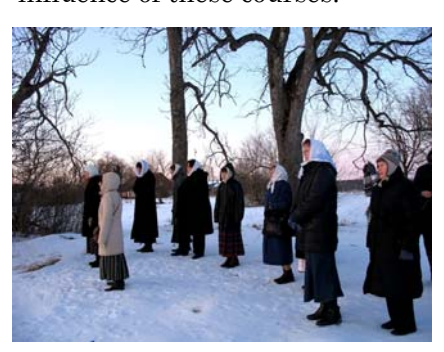
Opening of the folk club of Tsirguliina within the course "Folk singing" (25th of September 2009, photo by Arne Nommik)

The goals of the Training Centre have influenced the situation in local areas for example if people start celebrating traditional events with using of historical elements or the ensemble of a folk singing is created on the influence of these courses.