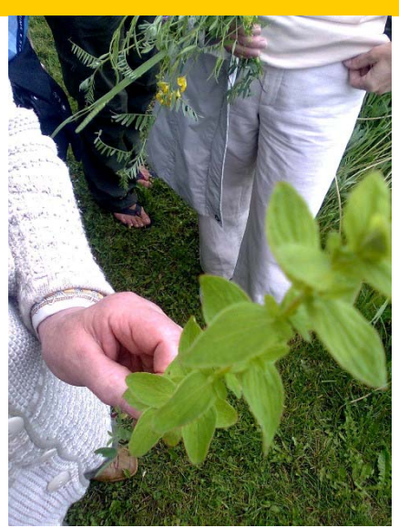
Lecture of the course "Folk medicine" (12th of June

Themes of the studies embrace different aspects of folklore – history, traditions, singing, national clothes and handicraft, folk belief etc. Most attractive courses are for example "Traditional culture of men" (where no women are al-