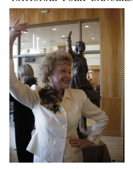
The ensemble, directed

On December 4th and 5th, 2009 the 50 <sup>th</sup> edition of "Christmas Around the World" took place at the Marriott Center on the campus of Brigham Young University in Provo, Utah in the USA. As usual, the event featured the world renowned BRIGHAM YOUNG UNIVERSITY INTERNATIONAL FOLK DANCERS.