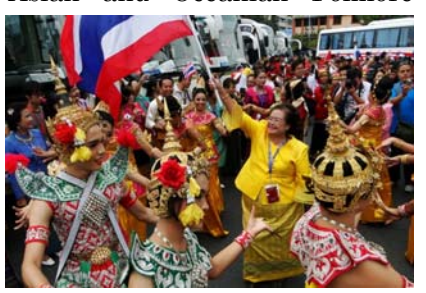
Parade at the Qinghefang Historical Street

West Lake. Divided in four groups, they performed in Hangzhou and nearby cities, including Zhuji, Chun'an and Jiande. The Closing Ceremony was held in the Wushan Square of Hangzhou and they also paraded in the Qinghefang Historical District. The plaque of the CIOFF Asian and Oceanian Folklore