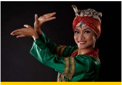
"Indonesian Dancer", Photo by Sandor Farkas 7th Place in "Portrait" Category -2nd CIOFF International Photo Competition 2009

This was the title of the photo competition organized by CIOFF Hungary this past festival season. CIOFF Hungary joined forces with one of the most visited Cultural portals in Hungary, Kulturpart (www.kulturpart.hu), where