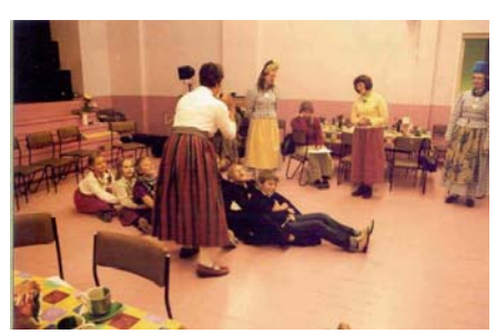
Celebration of the Women's Day within the course "Traditional Events of the Calendar" (25th of March

Training Centre of Estonian National Folklore Council (CIOFF Estonia) was founded in spring 2008. The basis of trainings is curriculum of traditional culture. There are at least 15 courses every year, from what most are about Estonian traditional culture, but there are also some for Estonian minorities. So, the target group involves people all over Estonia with different background, including CIOFF Estonia Youth Commission members (who are also helping to prepare the courses).