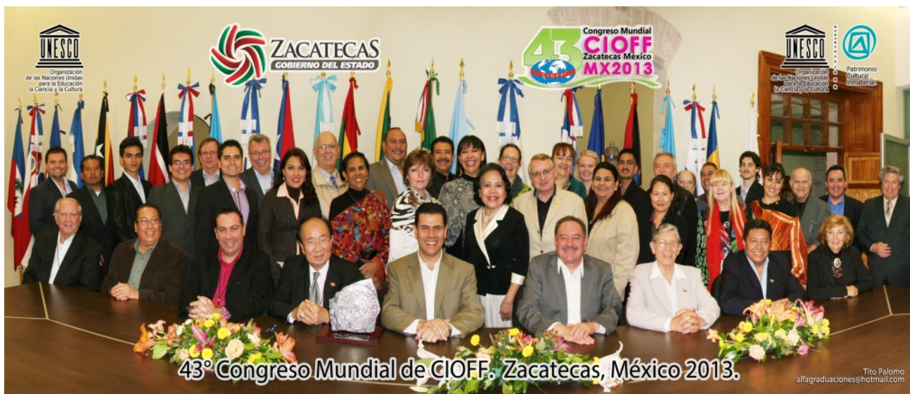
43° Congreso Mundial de CIOFF. Zacatecas, México 2013.