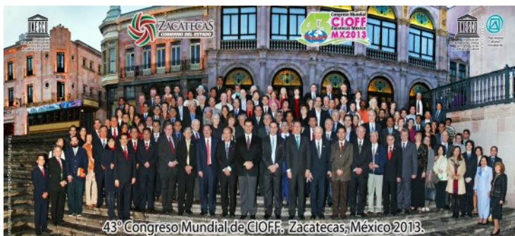
43º Congreso Mundial de CIOFF, Zacatecas, México 2013.