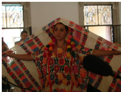
Indigenous festivity dedicated to honoring the dead, presented by