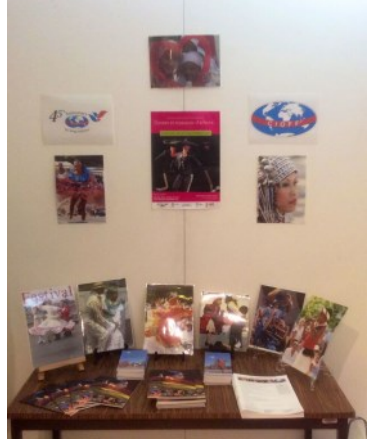
CIOFF Stand at UNESCO General Conference in Paris