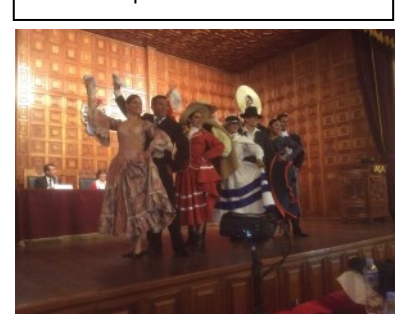
Cultural Conference 2015 in Arequipa