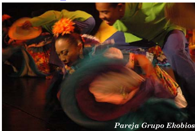
Pareja Grupo Ekobios

The third camp organized by the national youth commission of the National Section, will take place from January 29th to February 2nd 2009 and during the same the youth people will enjoy an academic day specially designed for them and to them. Likewise the commission will submit its general report, adopt the Plan of Action 2009 and elect its new members and representatives for the National Section Board, Also within the organizational diagram and for the sake of strengthening fraternity ties with the Latin-American people, an autonomous space will be