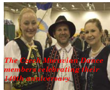
The Czech Moravian Dance members celebrating their 140th anniversary

ble beginning in the dark days of World War II when a small group of volunteers met to provide a way to the community that people of different background and ages are able to work together in harmony. The concept of the Holiday Folk Fair emerged, an island of intercultural friendship and unity in a world at war, a place where people could share their heritage with others. Fourteen ethnic