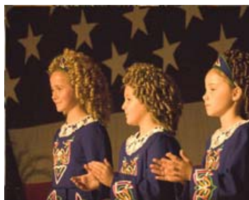
The Irish Children's Dance group honouring the International Year of the Potato and the 160th anniversary of the Irish Potato Famine

music and dance, language and demonstrations of traditional skills, crafts and food preparation featuring potatoes and honored the 160 th anniversary of the Irish potato famine that brought Irish immigrants to North America and Australia. This year's photo exhibits supported by UNESCO brought the world of Bangkok's urban refugees, Yann Arthus-Bertrand's Earth from Above (inspiring people to