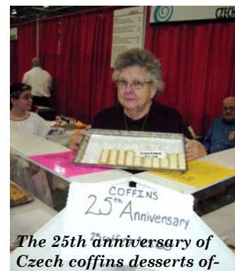
The 25th anniversary of Czech coffins desserts offered at the Holiday Folk

tional, which attracts more than 50,000 each year, had its hum-