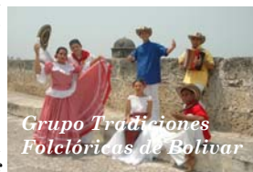
Grupo Tradiciones Folclóricas de Bolívar