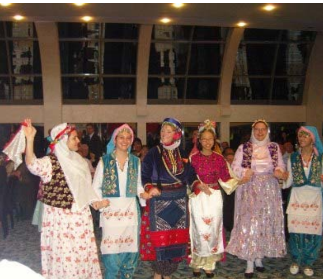
Turkish Dance performed at the Closing by CIOFF Youth members