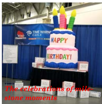
The celebrations of milestone moments

Milestone anniversaries provide communities with opportunities to celebrate. These moments create enjoyable experiences and generate a sense of continuity with previous generations and cultural identity. They honor those who volunteer and the audiences who experience the performance. These moments of cultural exchange highlight contributions that increase understanding and respect for others and build world peace one friendships at a time; they encourage the preservation, conservations and transmission of folklore and traditional knowledge and skills.