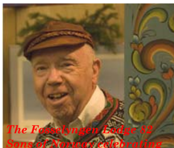
The Fosøyengen Lodge 62 Sons of Norway celebrating its 100th anniversary

tional, which attracts more than 50,000 each year, had its hum-