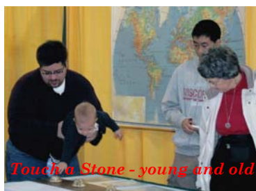
Touch a Stone - young and old

This celebration brings the world to Milwaukee through