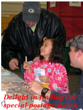
Delight in finding her special postage stamp

The Holiday Folk Fair International celebrated its sixty-fifth anniversary of bringing together more than sixty diverse ethnic communities to celebrate and share their cultural heritage. The festival is a constant reminder for the communities that they are the keepers of culture and that these communities have the great responsibility of passing their heritage on to the next generations. By celebrating both similarities that bind us together and differences that make us unique adds variety and fullness to our lives. Education continues to be the mission of the Holiday Folk Fair International; for it is through learning about other cultures that we begin to know those with whom we share the global neighbourhood. This concept of understanding, tolerance and respect has been and continues to be the focus of the Holiday Folk Fair International but on its celebration as well.