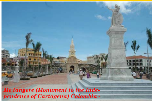
Me tangere (Monument to the Independence of Cartagena) Colombia -

During the year 2009 the INTERNATIONAL FOLKLORE CIRCUIT: BICENTENARY ROUTE will take place, organized by the National Sections of CIOFF Colombia and Venezuela. It is the first American dual national circuit, and this circuit joins, in a cultural journey, people and places which had a significant role in the independence of Latin America and the Caribbean. The circuit starts on June 1 st , in the city of Cartagena, Colombia, from where the groups will