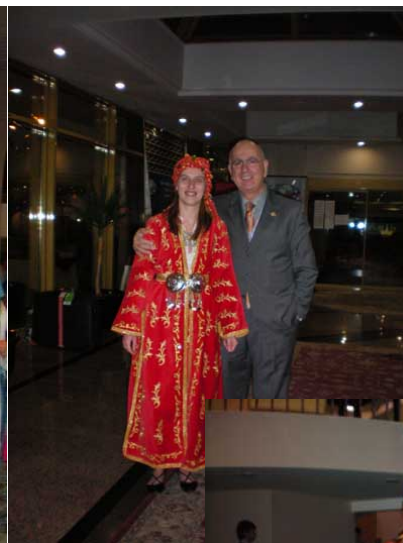
Fashion Show Turkish Style