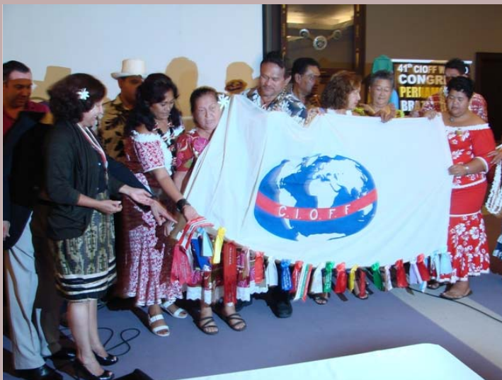
CIOFF® Tahiti passing the CIOFF® Congress Flag to CIOFF® Brazil

41st CIOFF® WORLD CONGRESS, Recife, Pernambuco, Brazil 12th-19th November 2011